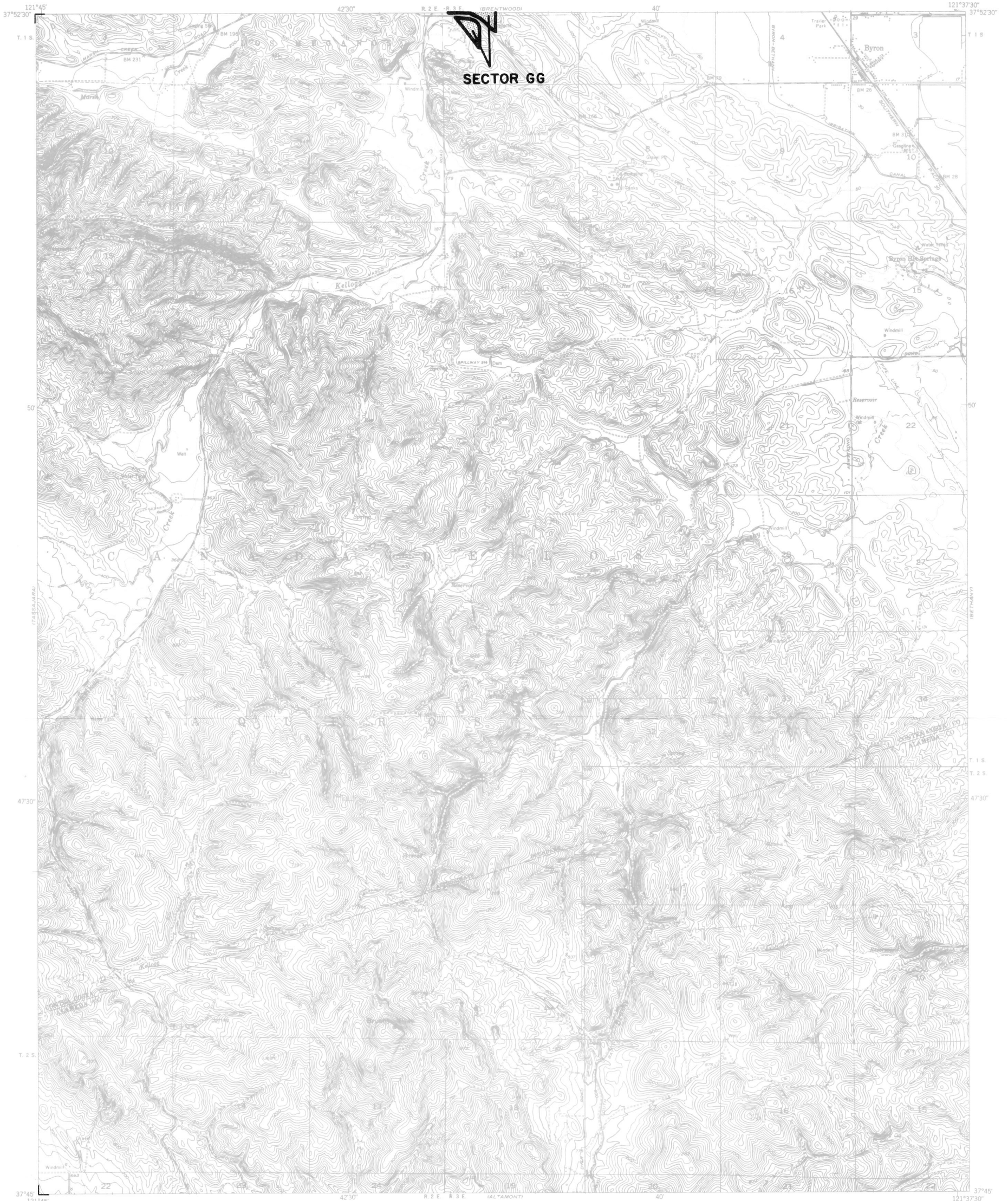
TOPOGRAPHIC BASE MAP BY U.S. GEOLOGICAL SURVEY Reduced from 1:24,000