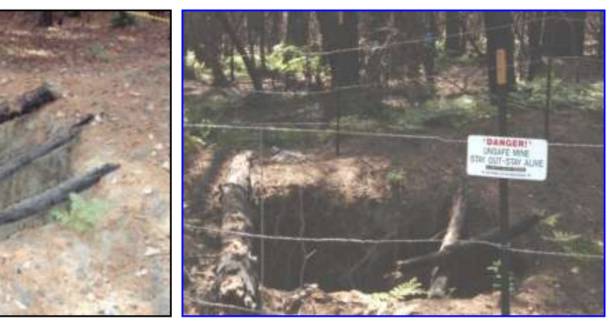
SUBSIDENCE NEAR WALKING TRAIL