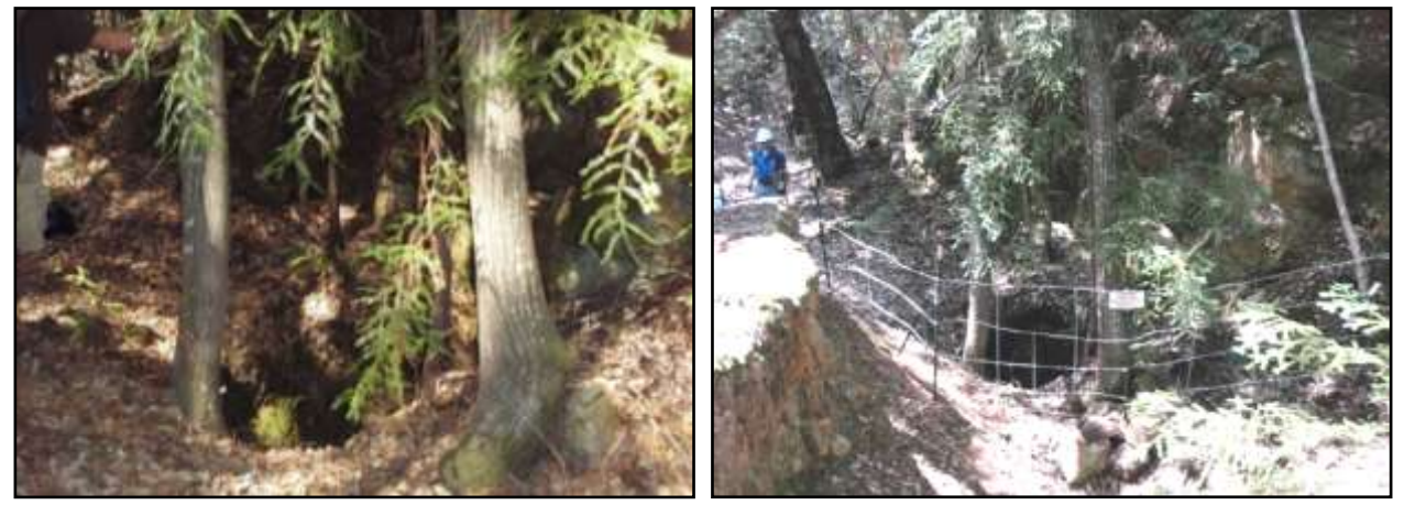
SHAFT BEFORE FENCING