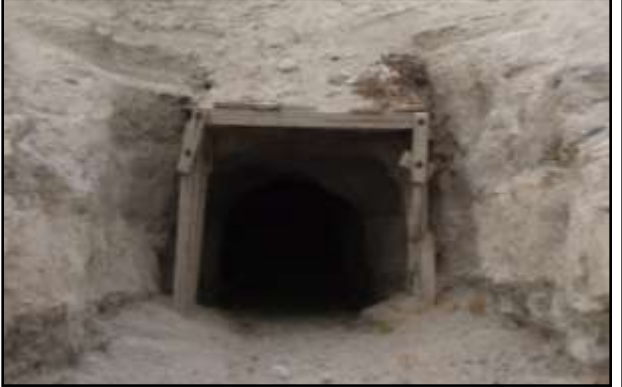
MINE WORKINGS AT ROARING RIDGE WITH MUCH EVIDENCE OF FOOT TRAFFIC INSIDE.