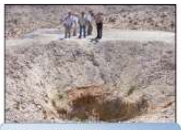
Open mine shaft at the Goat Basin Mine where a visitor died.

The cupola replaced a wire fence that BLM had installed around the shaft. Funding for the closure was secured in part by U.S. Senator Dianne Feinstein as part of the Consolidated Appropriations Act of 2008.