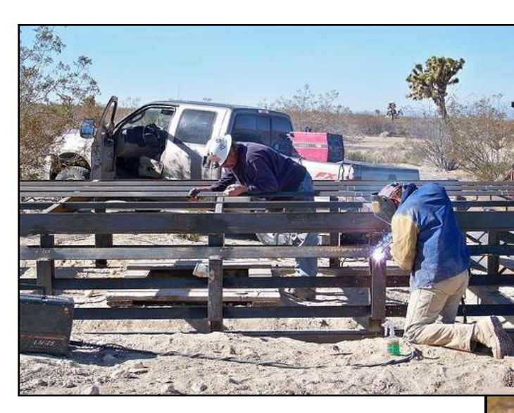
"The California Desert offers a myriad of recreational activities to thousands of people. Unfortunately, there are also a large number of hazards that can affect visitors as well. Working with the knowledgable state AMLU crew, we were able to pool our resources to effect more closures than would have otherwise been possible."

In January and February 2009, the AMLU partnered with the BLM Barstow Field Office to install four cupolas and a grate on abandoned mine shafts near the city of Barstow, CA. These hazardous shafts are located in an area with lots of public visitation. Bat compatible closures were installed to preserve habitat while protecting the public from these hazardous features.