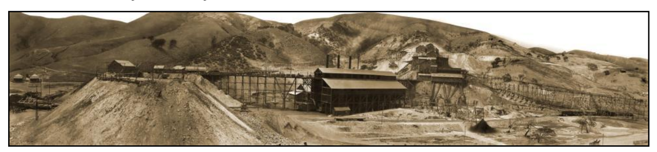
HISTORICAL PHOTO OF SITE

In January 2008, the AMLU and California State Parks teamed up to protect public safety by installing several bat gates on hazardous abandoned mine openings at a historically significant site that was once California's largest coal mining center. The agencies invited the media to view the closure and to highlight the site's historical value and the AMLU's "Stay Out – Stay Alive" message.