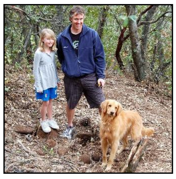
SHAFT SITE (AFTER THE CLOSURE)