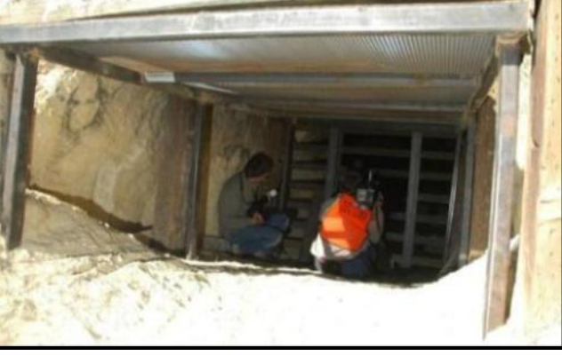
ADIT (AFTER GATE INSTALLED)