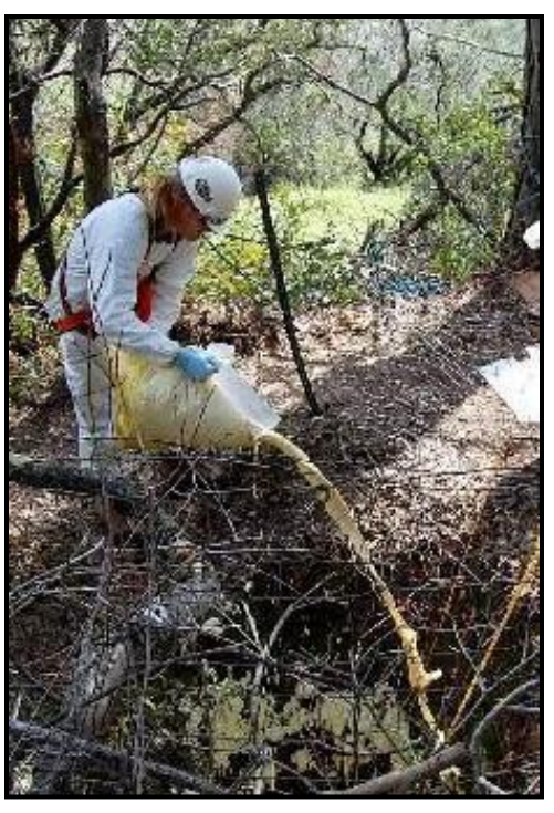
POURING PUF INTO THE SHAFT