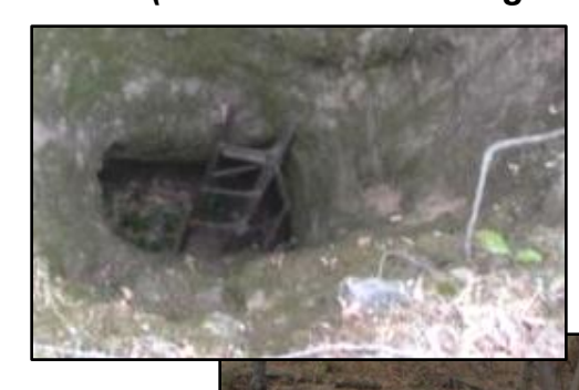
SHAFT BEFORE AND DURING PUF CLOSURE (before PUF covered with soil)