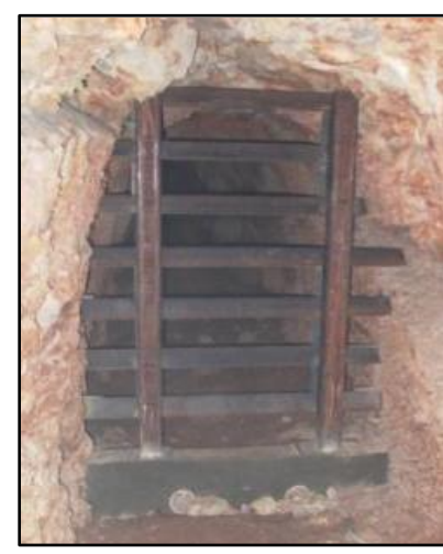
ADIT (before and after bat gate installed)