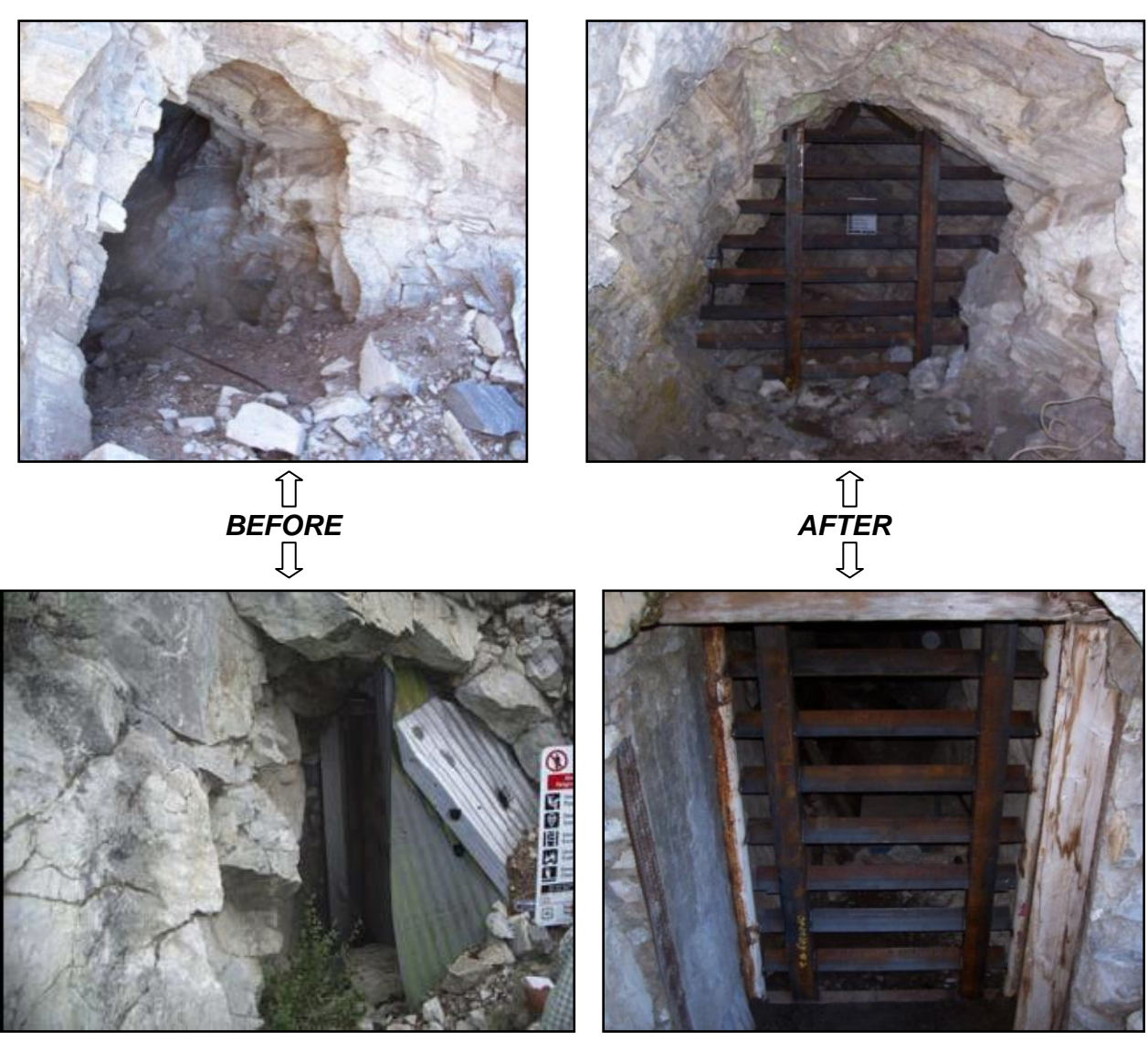
"The Forest Service works to increase the agency's effectiveness in partnership and collaboration with citizens, communities, governmental agencies and non-governmental organizations and others. The funding for Abandoned Mine Lands has been diminishing on a steady basis and we are glad that the Department of Conservation stepped in to help protect the public from entering these dangerous mine openings and protect bat habitat."

In December 2007, the AMLU partnered with the San Bernardino National Forest to close three adits in San Bernardino County. USFS staff installed bat gates at the entrances to the heavily visited features, which included a former powder magazine (a structure once used to store explosives). One adit had motorcycle tracks leading into the portal, and another contained abundant rodent droppings, some of which had developed a fungus that if touched could become airborne, posing the risk of transmitting the potentially deadly hantavirus. Fallen boulders in front of several adits were an indication that the adit portals were subject to collapse. The USFS also closed the road to the site to further keep the public out of this hazardous area.