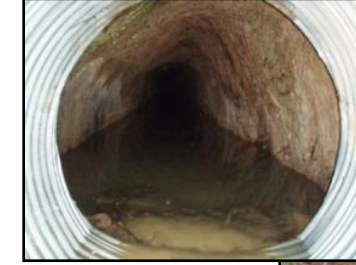
DURING AND AFTER