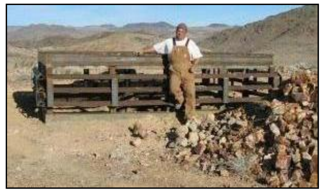
DURING (students and instructors building a bat cupola) AND AFTER

The AMLU, National Park Service, Army Corps of Engineers, and Bat Conservation International, Inc. collaborated in a bat gate building workshop with a classroom session held in Baker, CA, and hands-on training at the Paymaster Mine in the Mojave National Preserve. Students helped to construct one bat gate in a horizontal adit and two bat cupolas above hazardous vertical shafts, one of which was over 200 feet deep.