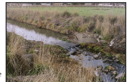
A channelized creek in Napa dominated by Harding grass, a non-native invasive weed.

Many species of exotic plants, introduced intentionally or unintentionally by humans, are spreading into riparian areas to the detriment of native vegetation. Giant reed ( Arundo donax ), periwinkle ( Vinca major ), tree of heaven ( Ailanthus altissima ), Himalayan blackberry ( Rubus discolor ) and other invasive weeds are becoming dominant in many riparian areas in Napa County. This shift in riparian species composition reduces native species diversity and habitat value, and alters the hydrology of local streams.