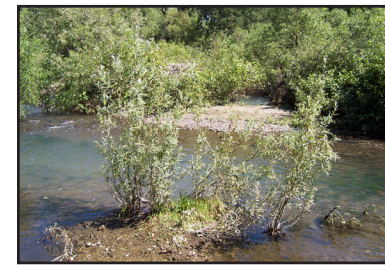
Sandbar willows ( Salix exigua ) thrive in areas subjected to periodic flooding.

Flooding is a natural disturbance that shapes riparian areas. Riparian plant composition, habitat structure and productivity are determined by the timing, duration and frequency of floods.