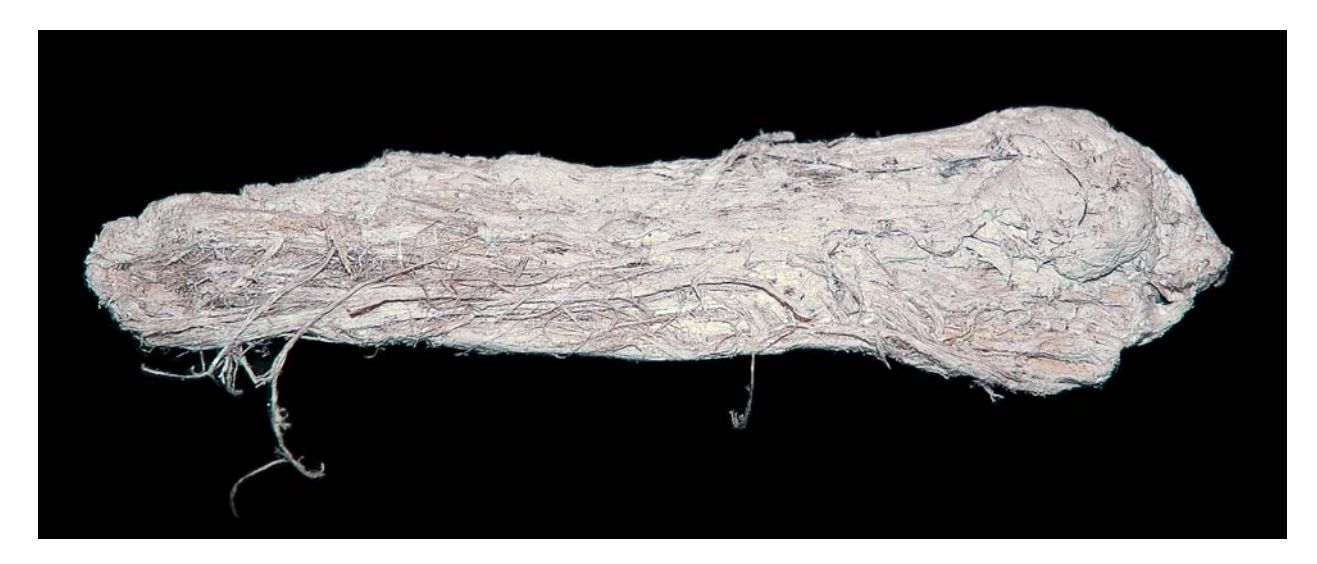
Figure 5. Amphibole asbestos from northeast of Colfax. Sample is about four inches long.