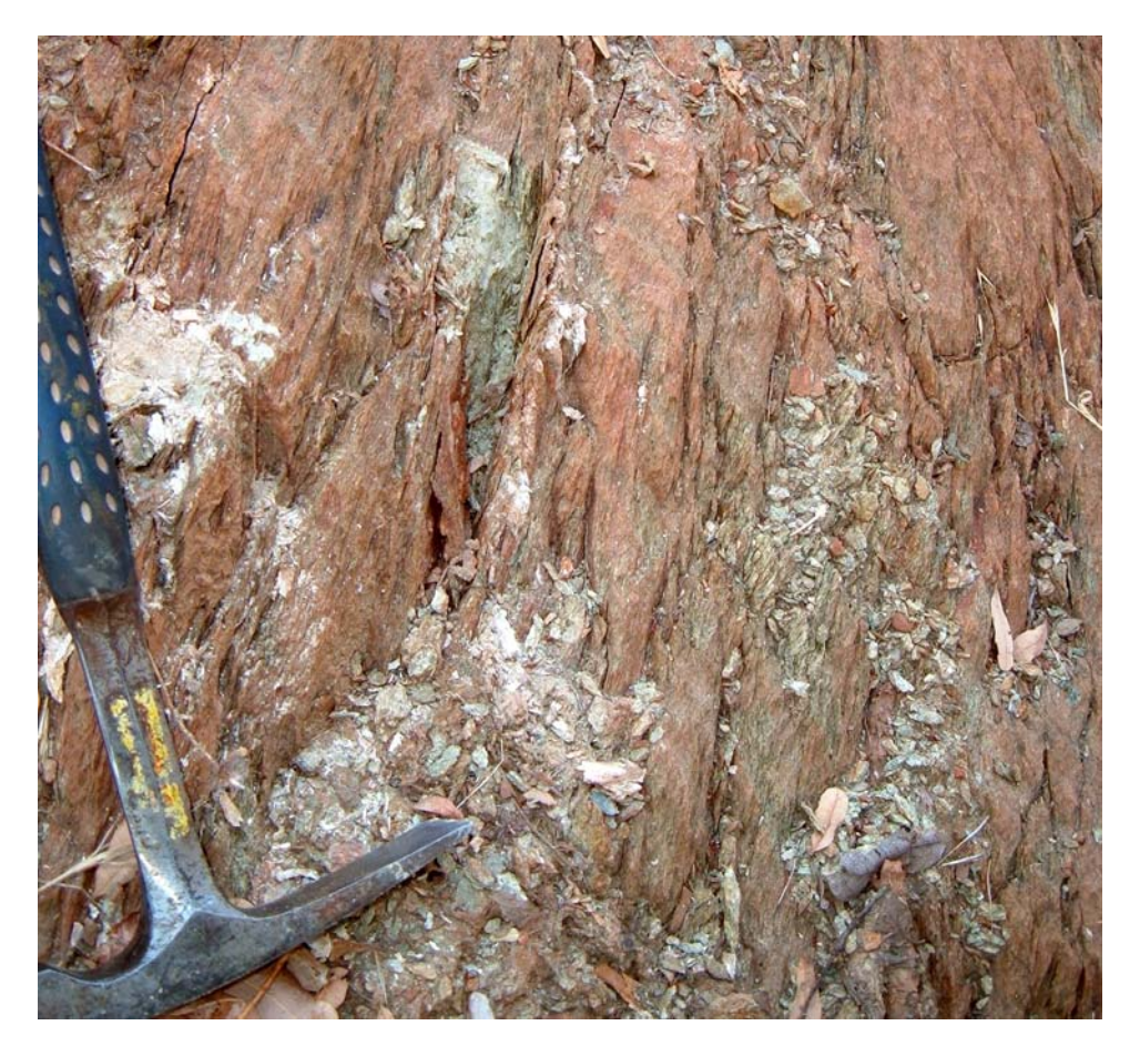
Figure 6. Amphibole asbestos in sheared metamorphic rock west of Auburn.