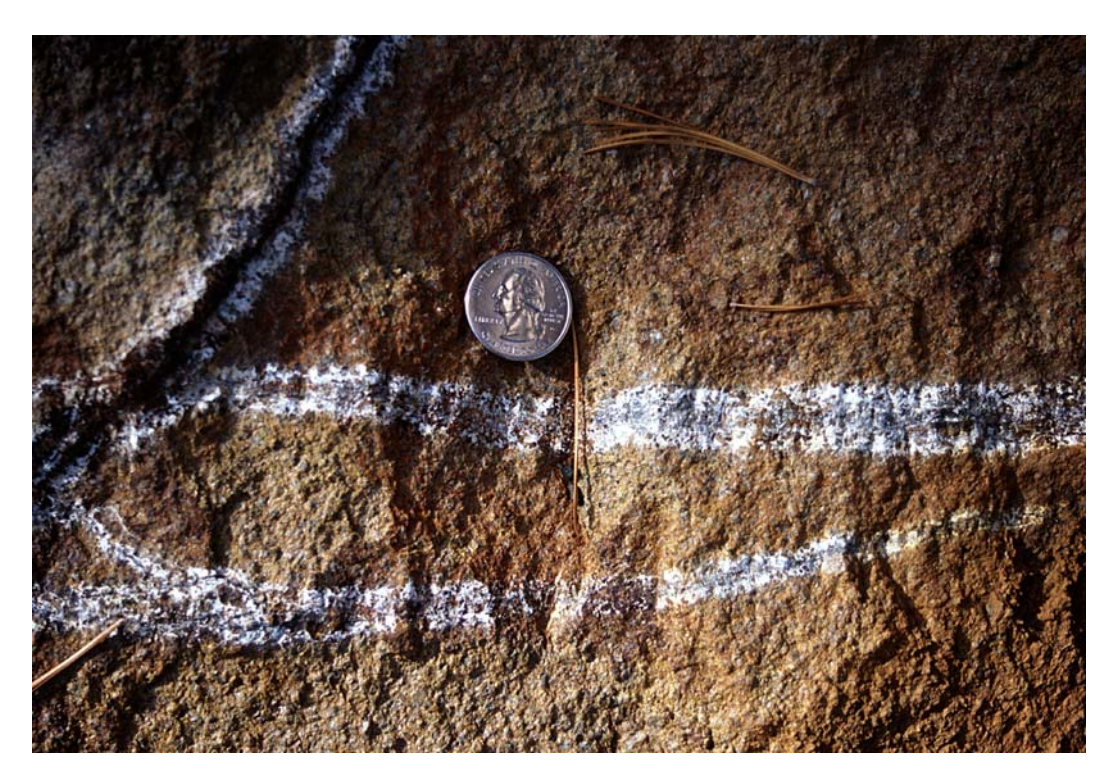
Figure 3. Veins of serpentinite in ultramafic rock from the Emigrant Gap area. Small bands of chrysotile are present within the veins.