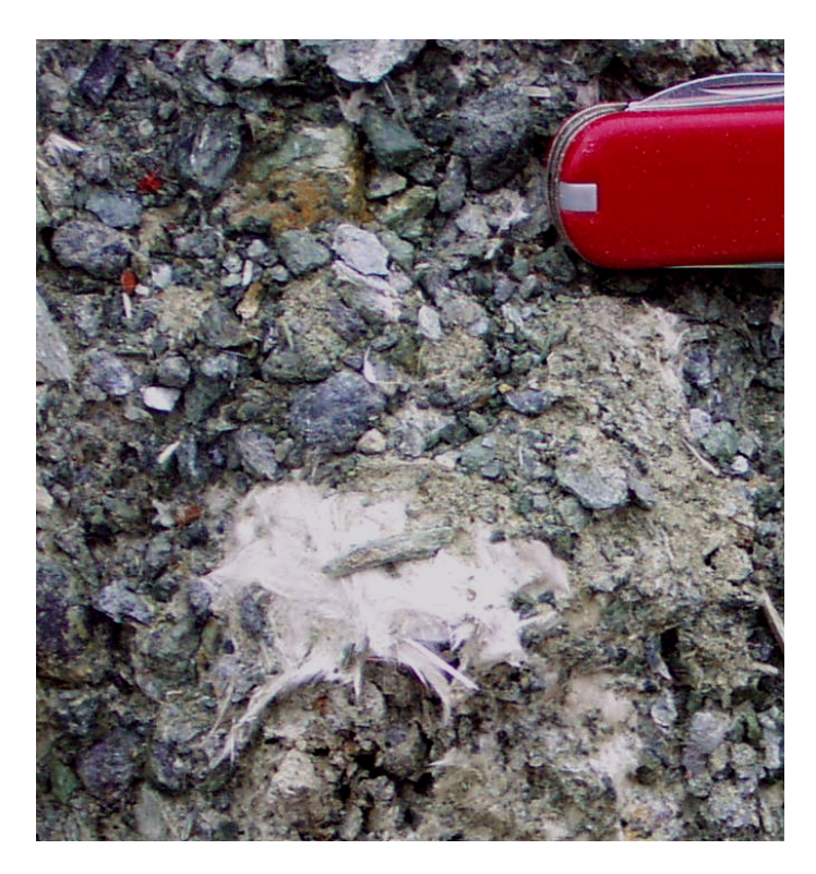
Figure 4. Chrysotile asbestos south of Foresthill Road between Auburn and Foresthill.

Figure 3. Veins of serpentinite in ultramafic rock from the Emigrant Gap area. Small bands of chrysotile are present within the veins.