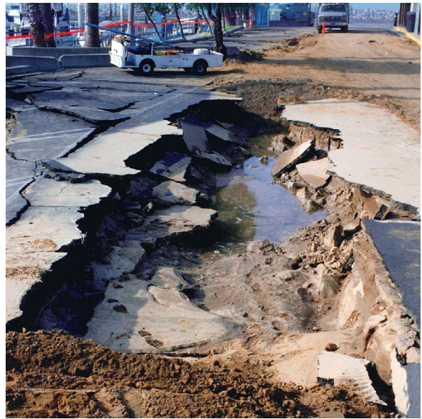
Liquefaction damage at Redondo Beach.