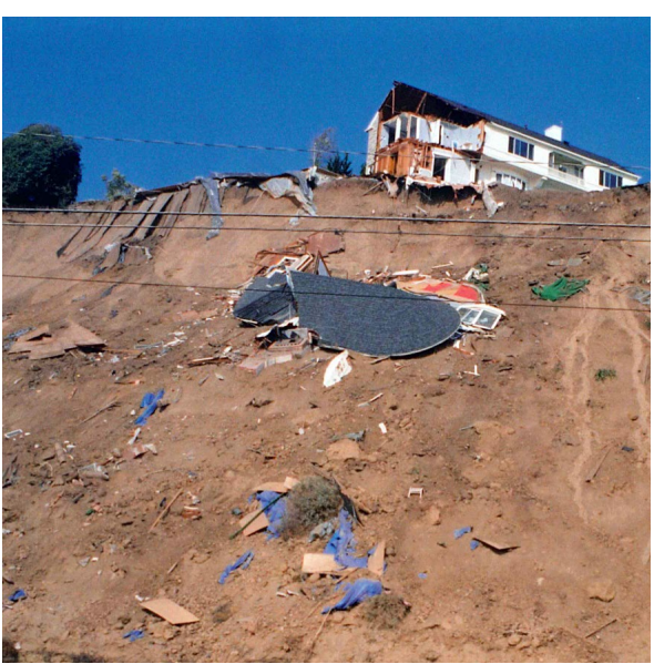
Landslide damage in Southern California.