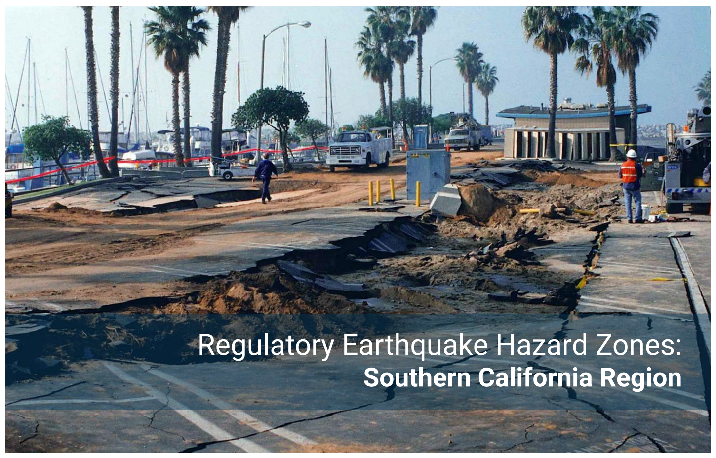
Damage to Redondo Beach from the 1994 Northridge Earthquake.

CGS studies earthquake hazards to help Californians plan and build earthquakeresistant communities