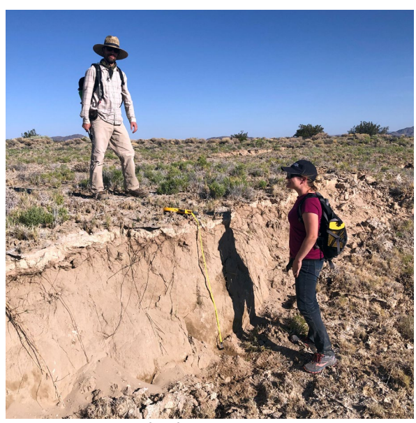
Surface fault rupture in Ridgecrest, CA.