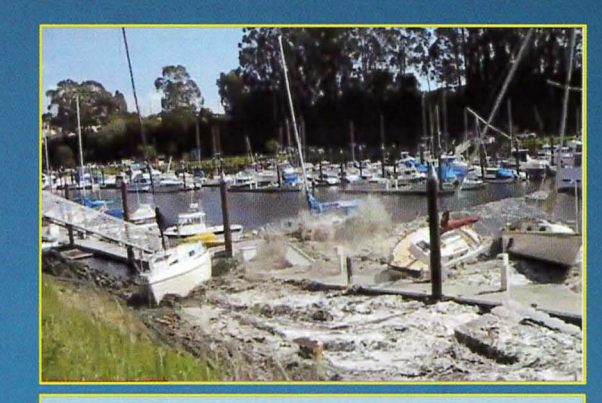
The March 11, 2011 tsunami in Santa Cruz Harbor