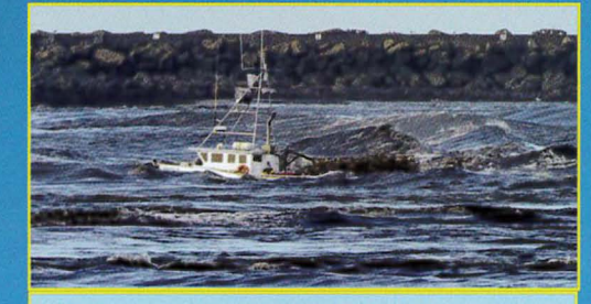
Boat attempting to leave Crescent City Harbor during the March 11, 2011 tsunami

If you do not have these essential preparedness items, DO NOT attempt to take your boat offshore. Secure your boat to the dock and leave the dock area before the tsunami arrives.