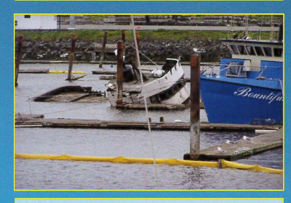
Crescent City Harbor after the March 11, 2011 tsunami