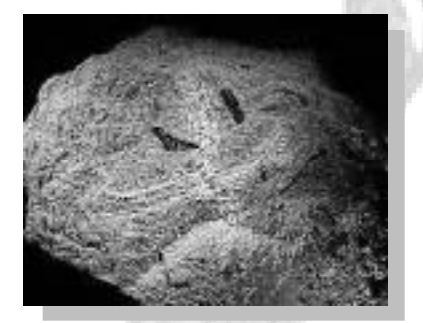
SEASTAR (STARFISH) Zoroasteridae AGE: late Miocene, 7-8.5 million years ago

Coprolites : Coprolites are fossilized animal excrement. They are important because they may show the structure of the animal's gut as well as indicate its diet.