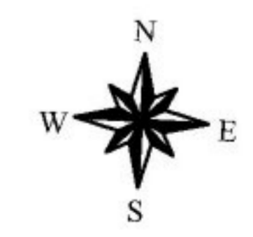
Plate 1 Map 7 of 7