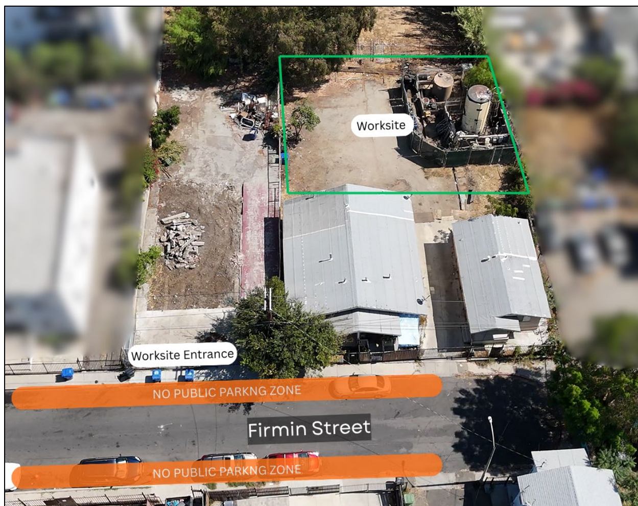
Figure 2 - Patel 2 Worksite Map