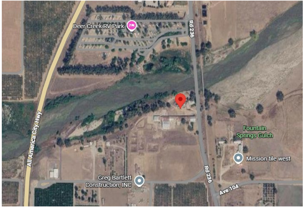
Photo #1: Satellite image of a rural area near Terra Bella, CA showing Rd 236, Deer Creek canal, and the marked residential site location.