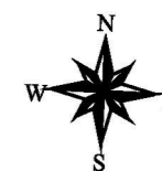
Plate 2 Map 6 of 19