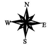
Plate 1 Map 9 of 19