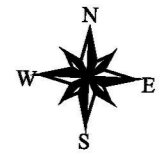
Plate 1 Map 11 of 19