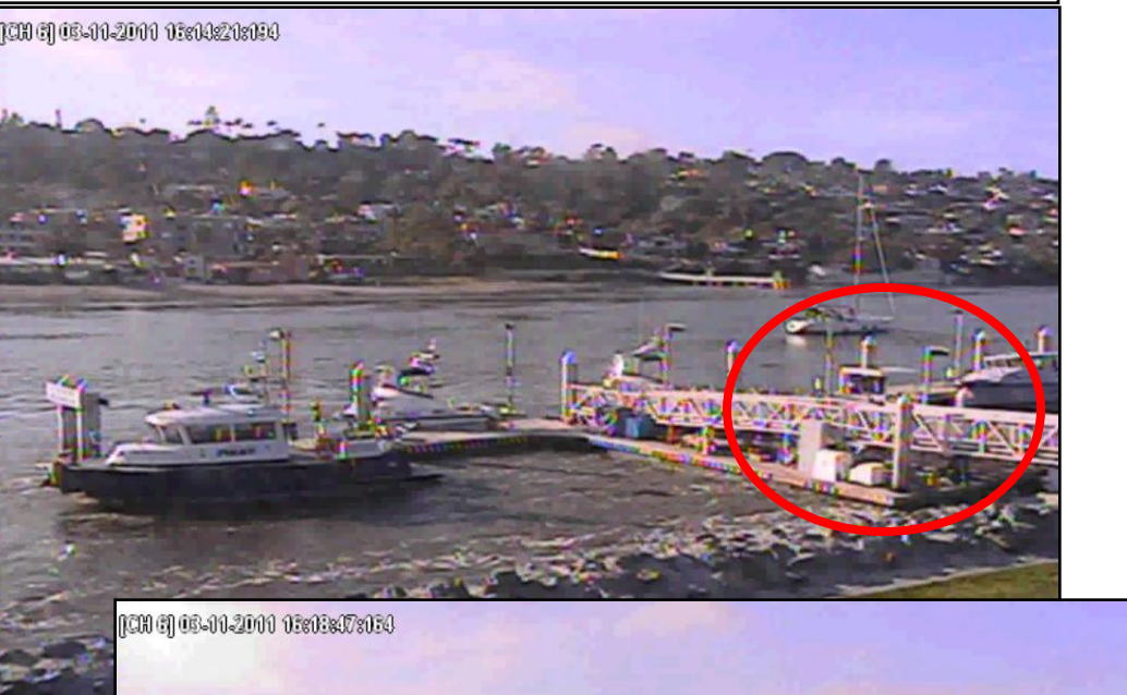
Table 1: Recorded and observed measurements and damage estimates in California from the February 27, 2010 and March 11, 2011 tsunamis. Current speed estimates may be overvalued because of inexperience of observers. Blank cells indicate that data was not collected for those locations; they do not represent zero values. Red boxes associated with photos to the left.

Boat sinks and damages dock due to strong drag in south Shelter Island, San Diego Bay.